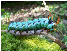
Hickory Horned Devil