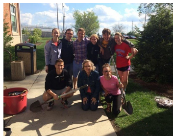
Left: student work crew ready to plant