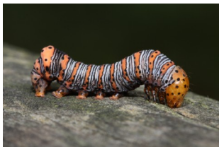
Beautiful Wood Nymph

Tyler emphasized that the rich diversity of caterpillars in the Red River Gorge area is due to the abundance and variety of food plants for the hungry, leaf-munching larvae. Without seeing images of what winged creatures these caterpillars will metamorphose into, the audience could appreciate them for their own unique larval beauty, which is often not recognizable in the adult butterfly or moth. We wondered at the survival of these caterpillars with so many predators ready to snatch them up.