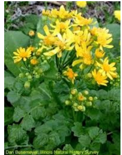
Ragwort in bloom in early summer

Stalks can be cut back for a neater appearance or to control self-seeding if it gets a bit too profuse. This native also sends out runners underground so it can quickly cover an area. It is easily transplanted from one area to another if you want to control where it spreads out. Ragwort can almost become “green mulch.”