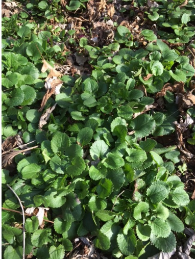
Golden ragwort plants is a reliable groundcover.

Ragwort is one of the earliest plants to emerge in the spring and it provides a nice ground cover that lasts most of the year. Stalks can be cut back for a neater appearance or to control self-seeding if it gets a bit too profuse. This native also sends out runners underground so it can quickly cover an area. It is easily transplanted from one area to another if you want to control where it spreads out. Ragwort can almost become “green mulch.”