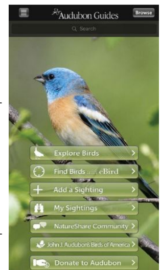
Audubon app free from iTunes

"when winter comes can spring be far behind??"