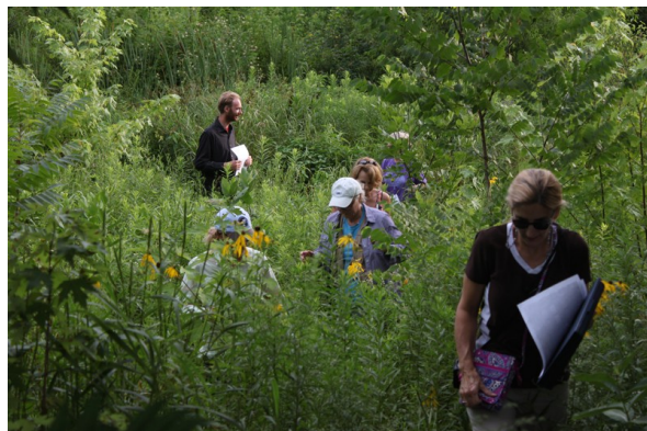
Wild Ones members assessing a stream restoration planting in 2016

This is our last chapter newsletter of 2017 and it invites reflection about the past year as well as about the future of our group. Our monthly meetings continue to be well attended suggesting that both the informative programs we offer and the opportunity to socialize with fellow environmentalists are appreciated. I like the fact that our meetings are open to non-members, and we always have first time visitors as well as people who return occasionally. I hope that we will continue to be a welcoming organization.